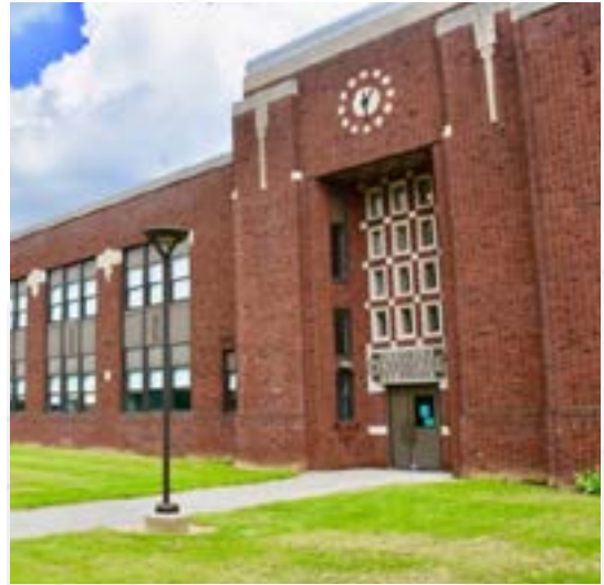
Washington Elementary School 545 S Ann Street Lancaster, PA 17602