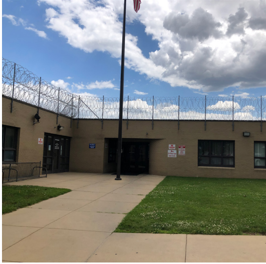
Lebanon County Correctional Facility 730 E Walnut Street Lebanon, PA 17042