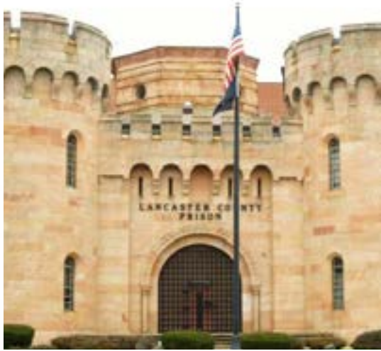
Lancaster Prison 625 E King Street Lancaster, PA 17602