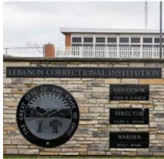
Lebanon Prison 730 E Walnut Street Lebanon, PA 17042