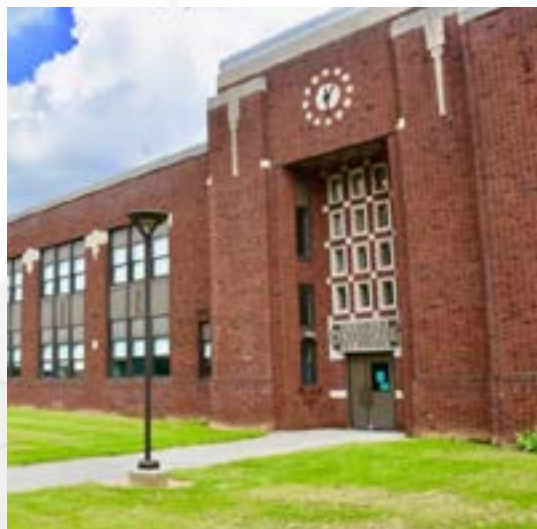
Washington Elementary School 545 S Ann Street Lancaster, PA 17602