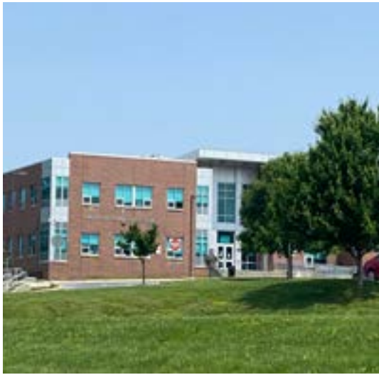
Lafayette Elementary School 1000 Fremont Street Lancaster, PA 17603