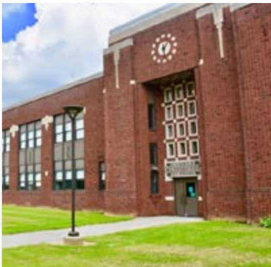
Washington Elementary School 545 S Ann Street Lancaster, PA 17602