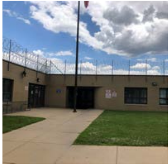
Lebanon County Correctional Facility 730 E Walnut Street Lebanon, PA 17042